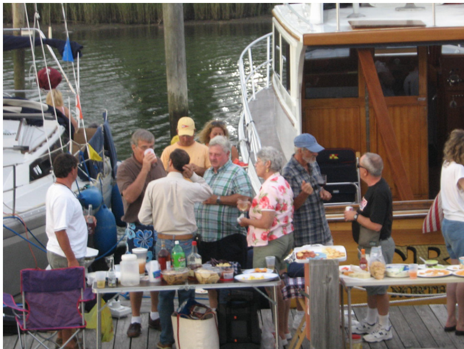
The first-night welcome party gets underway at the 2007 rOnDAYvous® in Milford.

At one memorable rOnDAYvous® – the 2004 event at Liberty Landing Marina – attendees whipped up a sumptuous dockside party that lasted well into the first night. A tradition was born, too, as